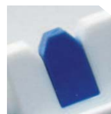
Close-up of silicone rubber dividers